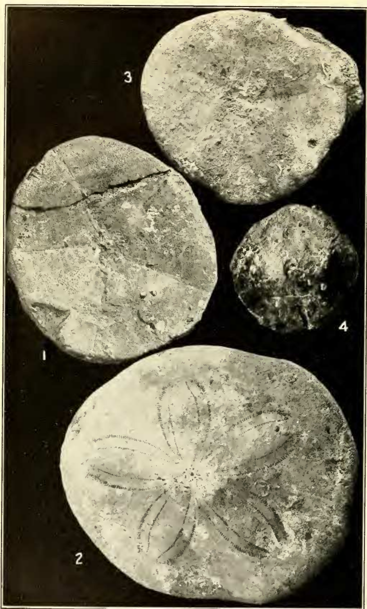
1, Clypeaster marinanns , new species, Mesón formation, Hacienda Santa Fé, Topila, Mexico, locality M19V, paratype, ventral view, U.S.N.M. no. 496277; 2, C. topilanus , new species, same formation and locality, holotype, dorsal view, U.S.N.M. no. 496278; 3, C. topilanus , same formation and locality, Corona collection no. 14, paratype, ventral view, U.S.N.M. no. 496279; 4, Laganum leptum , new species, Mesón formation, on line of Transcontinental Railroad, lot 145, Hacienda Chinampa, 8 km east of town of Chinampa, Canton Tuxpan, Veracruz, at the first cut examined November 28, 1920, holotype, dorsal view, U.S.N.M. no. 496280. (Five-sixths natural size.)